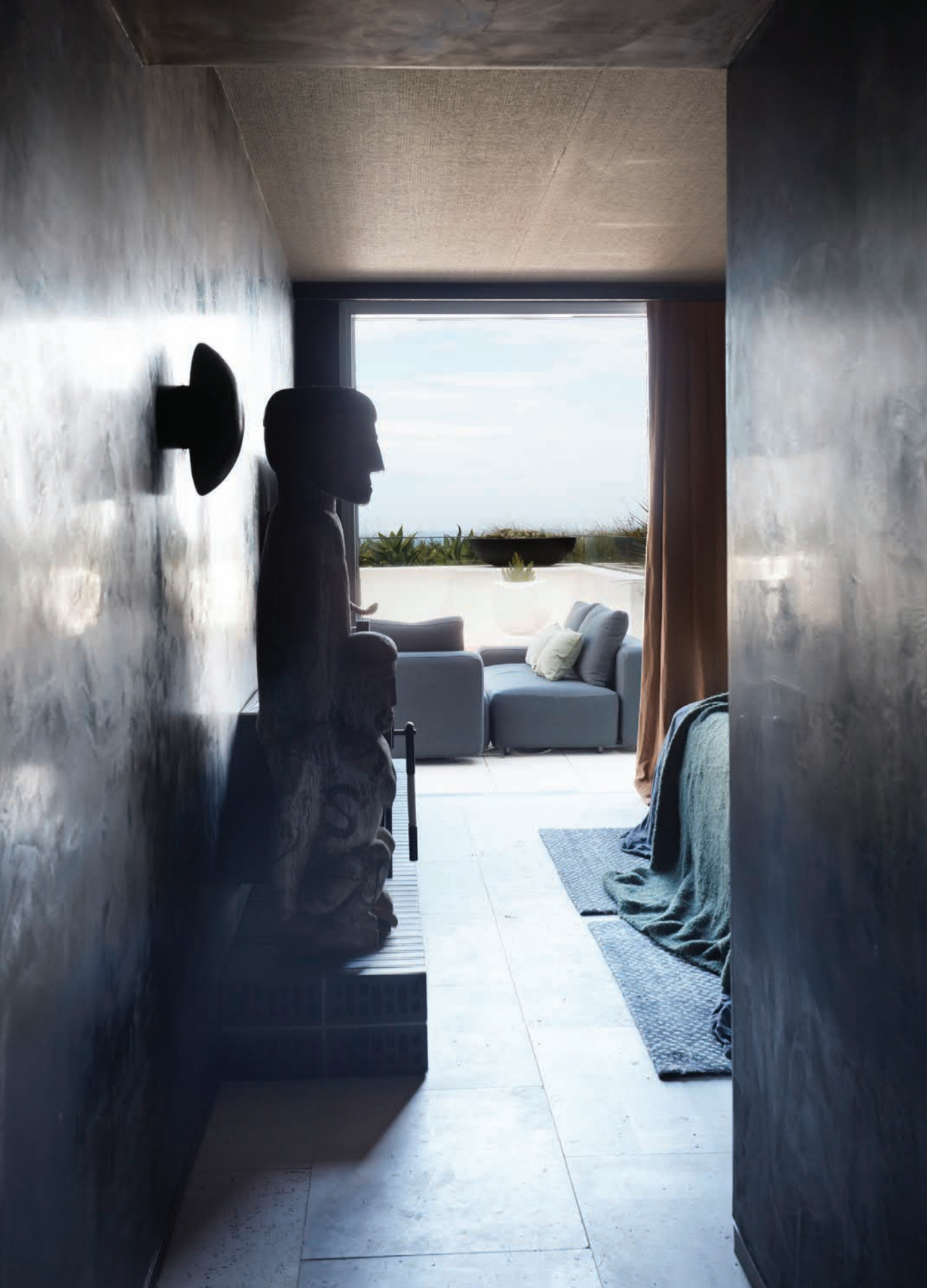
above —The black Marmorino bounces light into the bedroom without creating glare. opposite —Vintage brass wall light (Pamona, France) and Charlotte Perriand LCT chair (Cult)