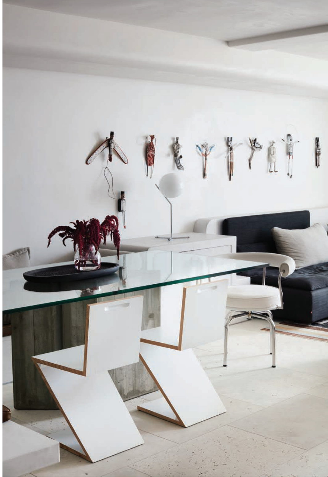
previous left—Marmorino walls and ceiling bring a lustrous light throughout. previous right—Cassina Utrecht armchair in Charlotte (CULT) adds solid colour and form. above—Vintage Saporiti table (Vamp) and Cassina Zig Zag chairs (CULT). opposite—Custom joinery and custom brass handles

This subtle contextualising of the artworks sits comfortably with more than the unusual use of materials. In the living room, for example, the